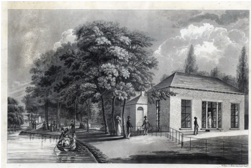
Thetford Spa