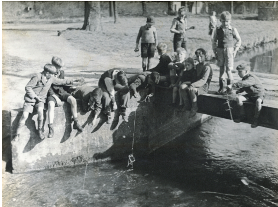
Children fishing at Thetford Iron Bridges 1954