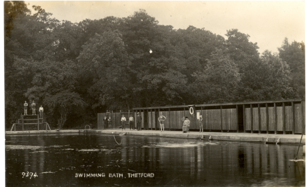
Thetford swimming baths, about 1925.